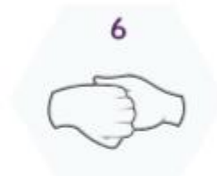
6 Rub the backs of fingers on the opposing palms