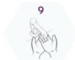
9 Rinse hands with water