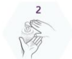
2 Apply enough soap