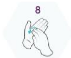
8 Rotational rubbing, backwards and forwards with clasped fingers in your palm