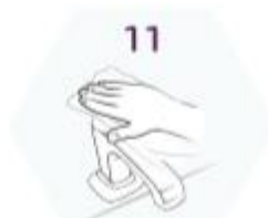
11 Use the towel to turn off the faucet