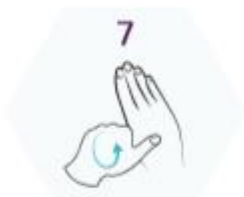
7 Rotational rubbing of thumb clasped in your palm