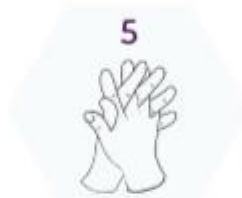
5 Palm to palm with fingers interlaced