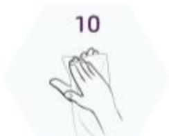
10 Dry thoroughly with a single use towel