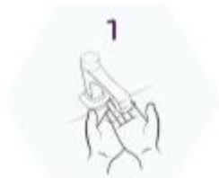
1 Wet hands with water