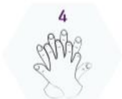
4 Right palm over left dorsum with interlaced fingers and vice versa