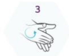
3 Rub hands palm to palm