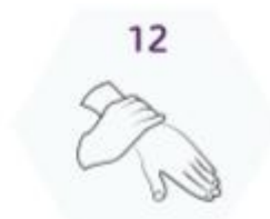
12 ... and your hands are safe

© 2020 FLI Group Services, Patricia Chelidioti, ReinventoJan 43, 1040 Brussels - BE0077-20200115